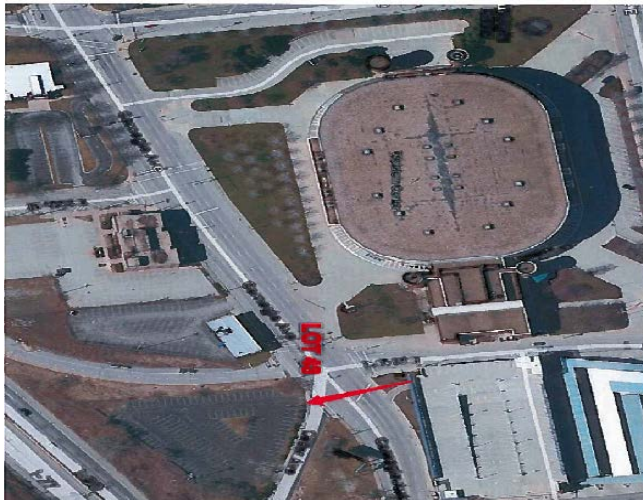
Arrow pointing to Lot 43

The Buckeye Regional Planning Committee.